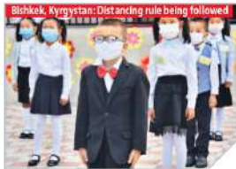
Bishkek, Kyrgyzstan: Distancing rule being followed