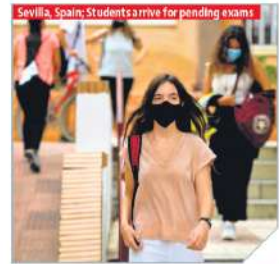
Seville, Spain: Students arrive for pending exams