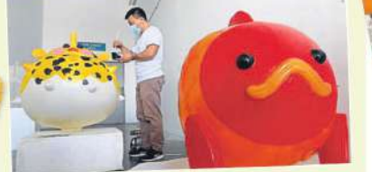
A man puts finishing touches to a fish lantern installation to light up the compound of a public building ahead of the Mid-Autumn Festival in Singapore on Wednesday. The festival celebrates the end of the autumn harvest.