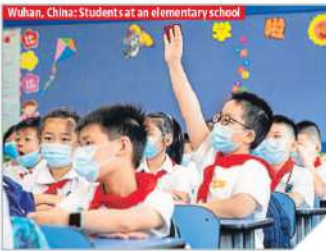
Wuhan, China: Student at an elementary school