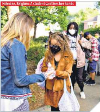
Helede, Belgium: A student sanitises her hands