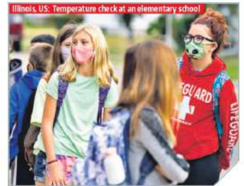
Illinois, US: Temperature check at an elementary school