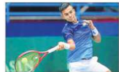
Sumit Nagal, who beat American Bradley Klahn, will face world no. 3 Dominic Thiem at the US Open on Thursday

Researchers believe a passenger, whose gender was not identified, was likely patient zero because the person had been in contact with people from Wuhan, where the contagion emerged last year. (See also pg2) AFP