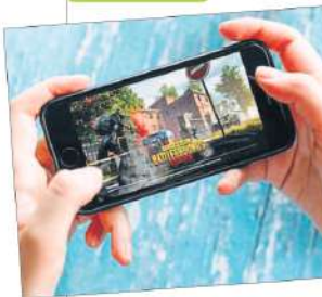
This is the third time India has banned China-linked apps in a stepped-up backlash over an increasingly bitter border showdown between the neighbours