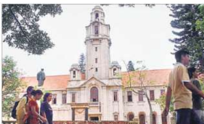
The IISc, Bengaluru, (in the pic) maintains its position as the highest-ranked Indian university since it first qualified for the rankings in 2015

"With proposed comprehensive changes to Indian higher education, such as the approval for foreign universities to open campuses in India, the policy is an incredibly exciting turning point for the country", he said.