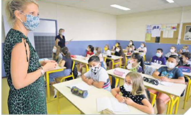
Nice, France: A class in progress at the Henri Matisse School