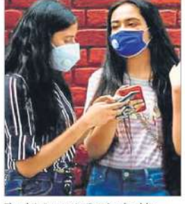
The exhalation port significantly reduced the effectiveness of the mask as a means of source control, as a large number of droplets passed through the valve unfiltered and unhindered, the researchers said. (REPRESENTATIONAL IMAGE) PPTFE